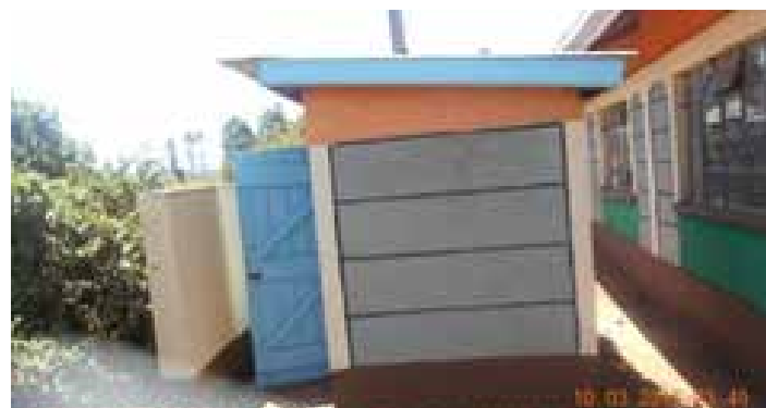
NYAMBOGO ECDE FLAGSHIP PROJECT - TOILETS