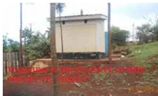
MAKAIRO ECDE CLASS FLAGSHIP PROJECT - TOILETS