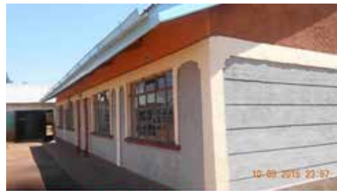
NYAMBOGO ECDE CLASS FLAGSHIP PROJECT - CLASSROOM & TANK