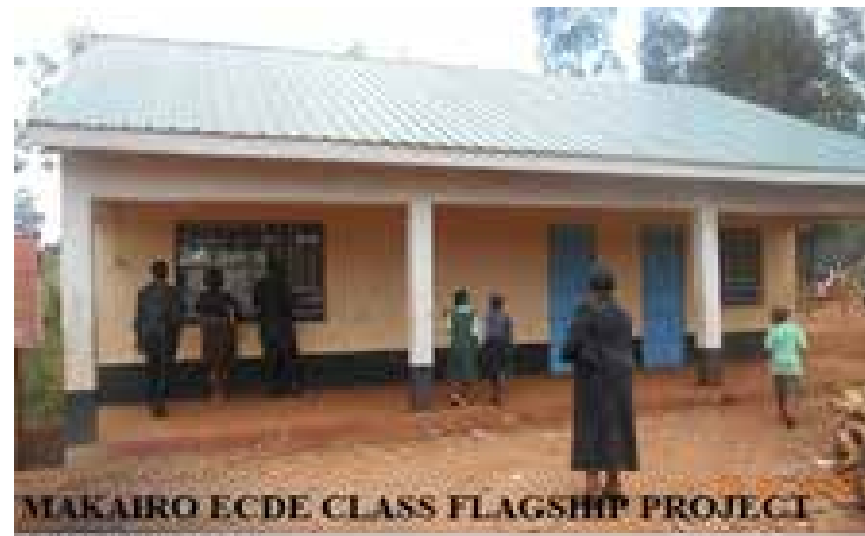
MAKAIRO ECDE CLASS FLAGSHIP PROJECT - CLASSROOM