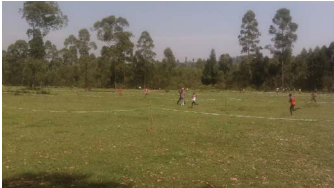
Athletes at Sironga field during the regional cross country.

The department is actively involved in improving and nurturing the athletics talents across the county