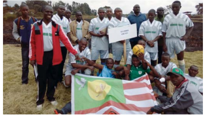
Nyamira county football team at Mangu high school during the inter-county competitions held in Kiambu County.