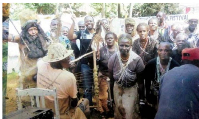
Gusii cultural dance