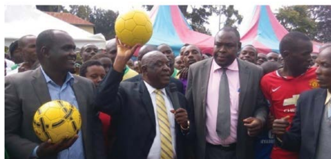
View of Manga Stadium