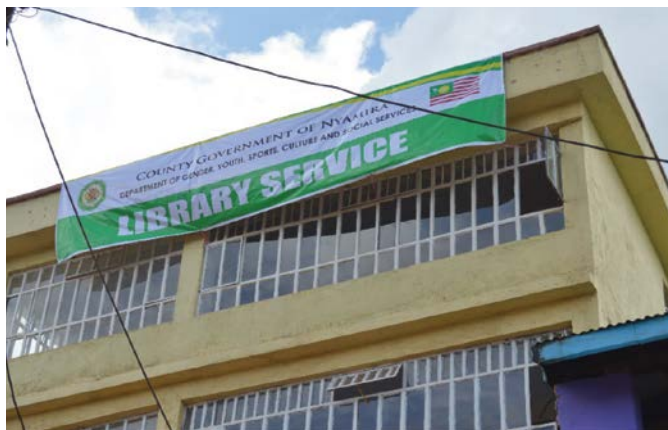
The Established and equipped County Library located in Nyamira town