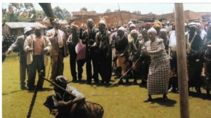
Otenyo cultural dancers performing during a cultural event