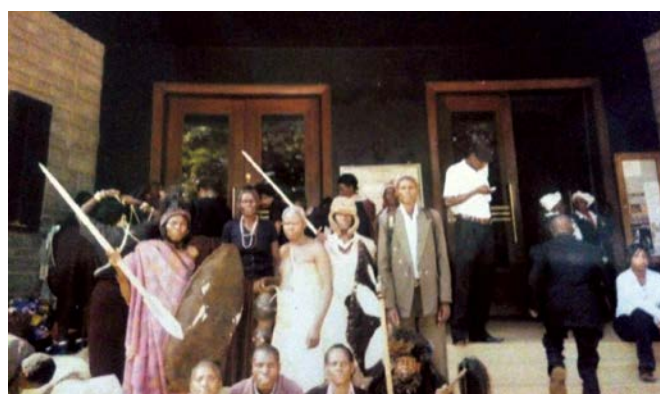
Otenyo Cultural dancers at the Nairobi National Theatre during Kenya Music and Cultural Festival