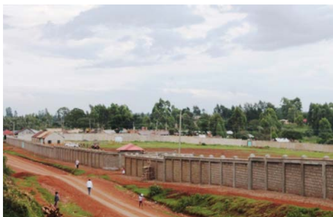
View of Manga Stadium