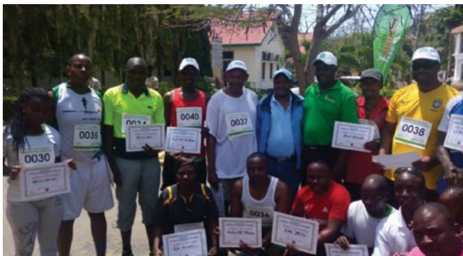
Athletics team after receiving their participation certificates in Mombasa during the Mombasa International Marathon on 25th Sept 2016.