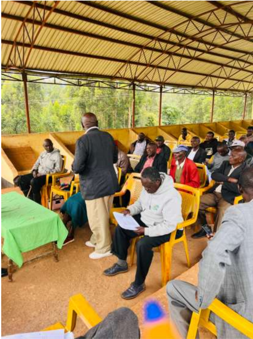
Public participation forum on ADP documentation under discussion