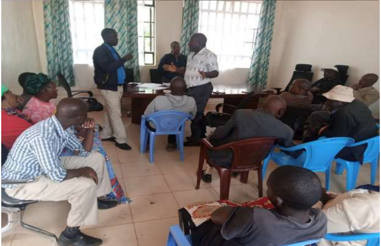
Members of the Public Keenly Listening to the County Officer taking them through The ADP Documentation