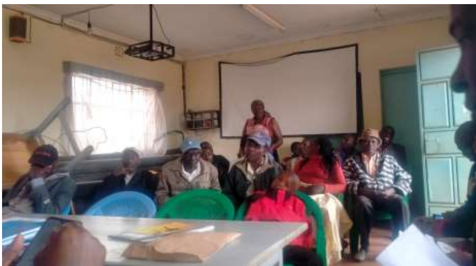
A mama mboga expressing her views on the market issues