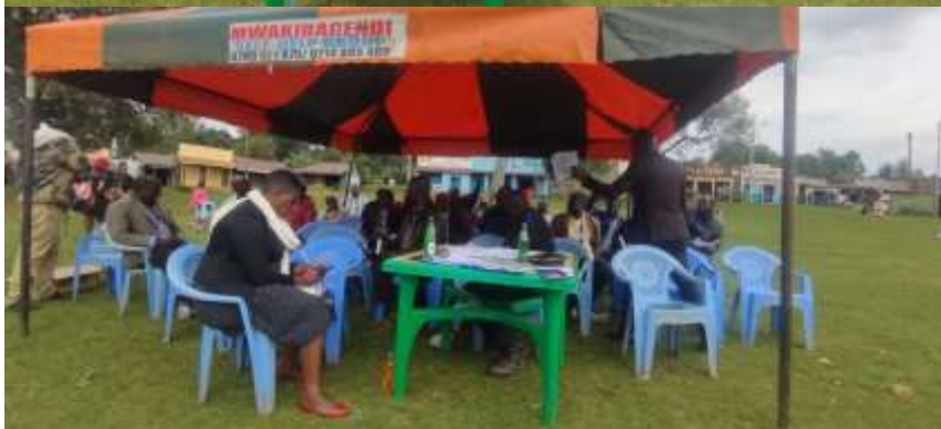
The public following on the ADP presentation