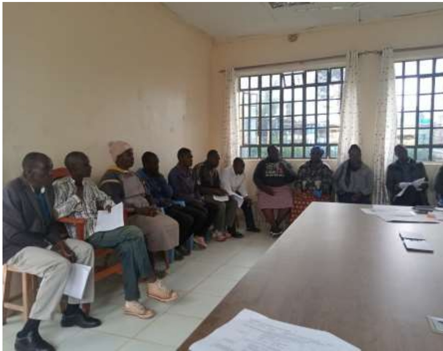
Members of the public at the Mekenene Mca's office following on ADP documentation presentations from the County government staff