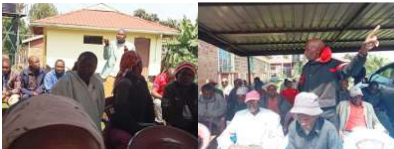
Boda Boda rider elaborating why they need boda boda shed at Borabu stage