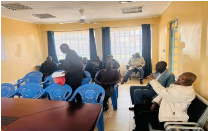
Members of the Public taken through the ADP documentation