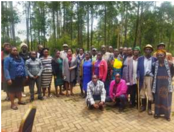
Group photo at the end of our meeting