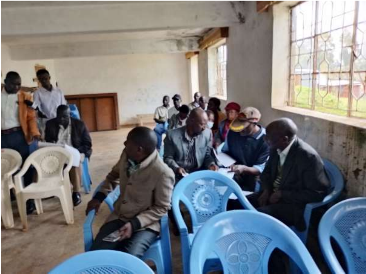
The public following the ADP documentation presentation