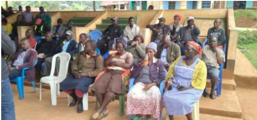
Members of the Public during Public Participation