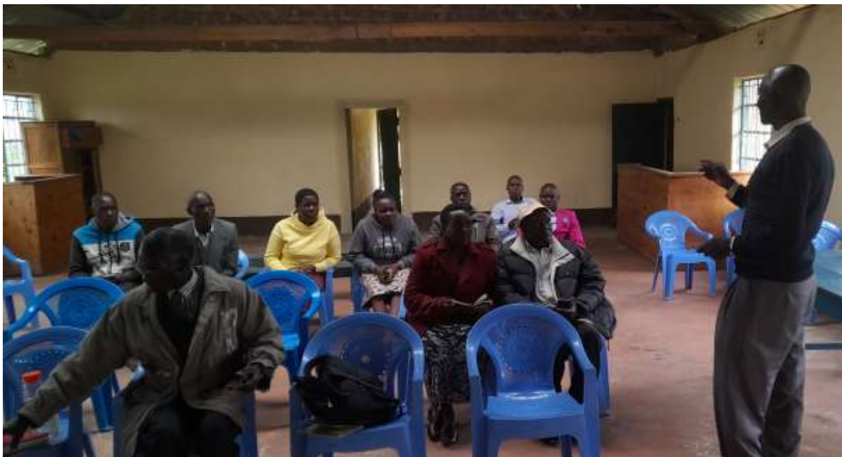
The public taken through the ADP procedures and documentation for easy understanding