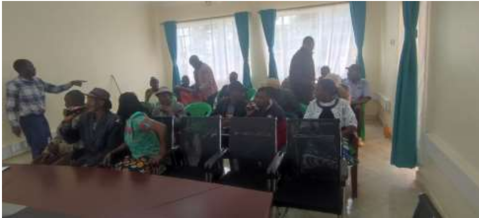
Members of the public taken through ADP Documentation Attendance list