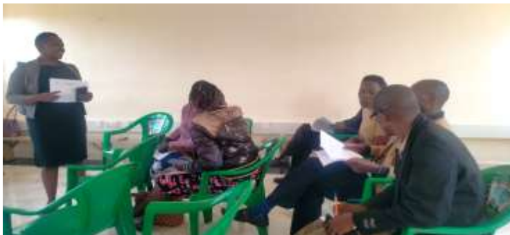
Participants going through the highlighted projects