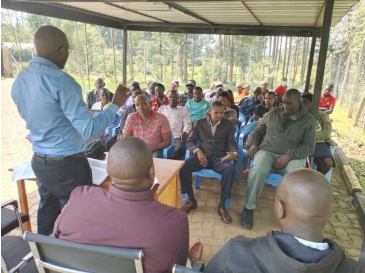
The public taken through the ADP