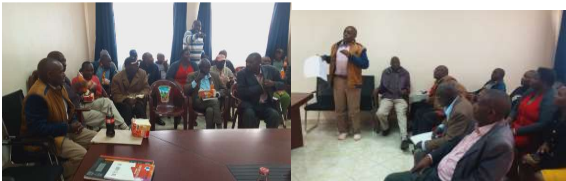
Members of the Public during the discussion in Nyamaiya Ward