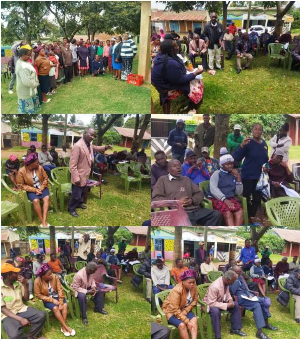
The public keenly following the ADP documentation presentation from the County officers