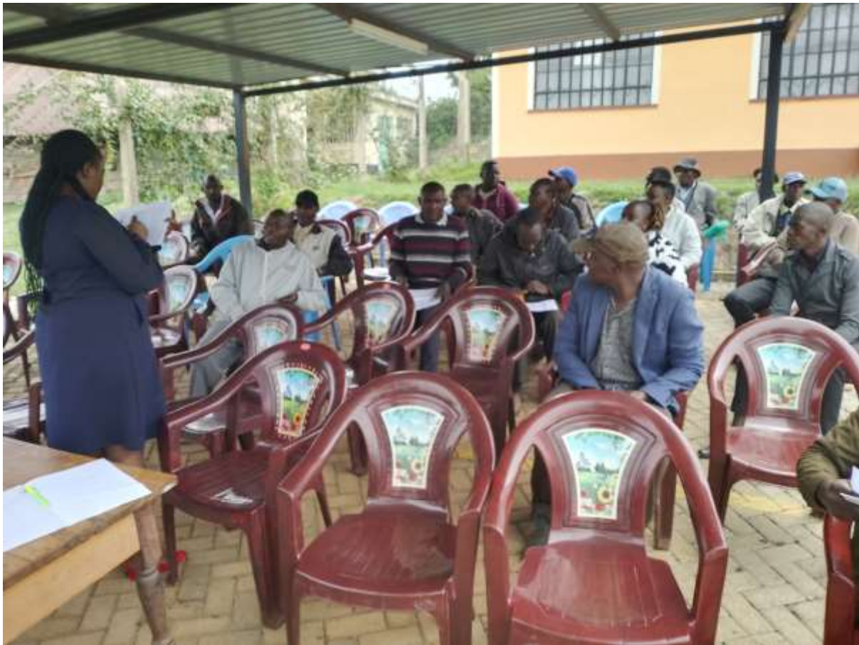
Ms Nyanumba ( Economist) taking the public through the public participation documentation of ADP