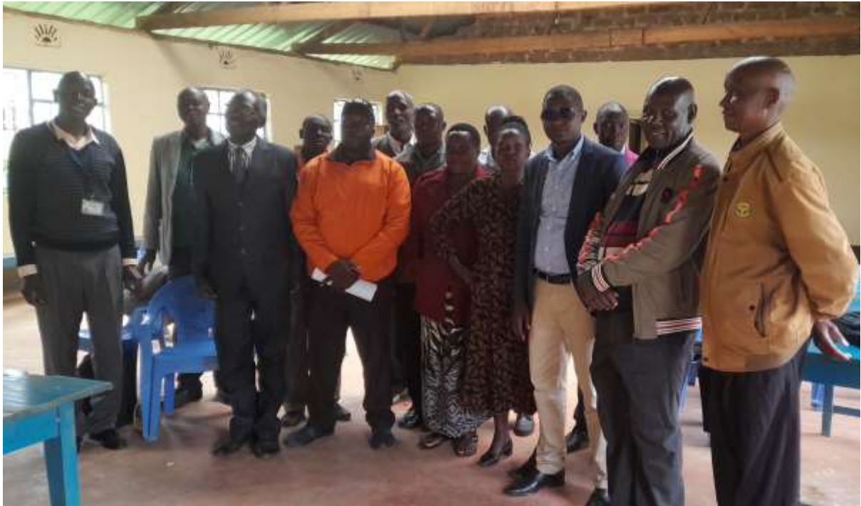
Group photograph of the public and county officers after ADP deliberations